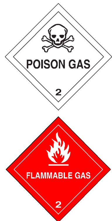
Figure 3: Transportation Labels

Safetygram-31: “Cylinder Valve Connections”