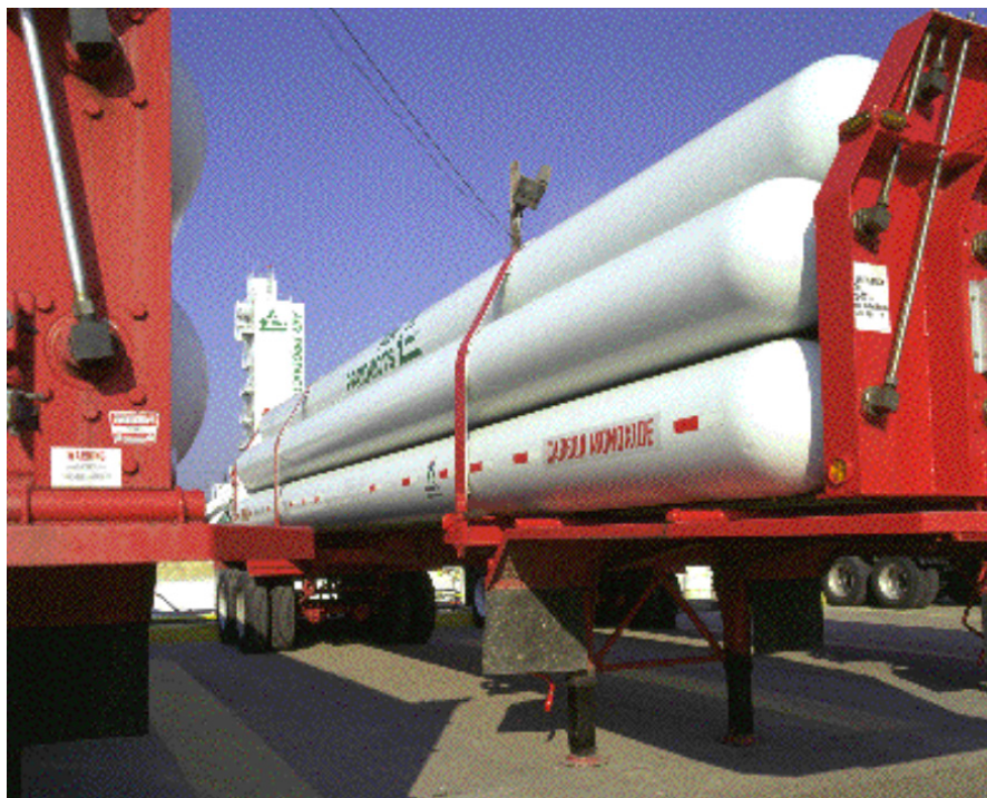
Figure 2: Typical Ground Tube Installation